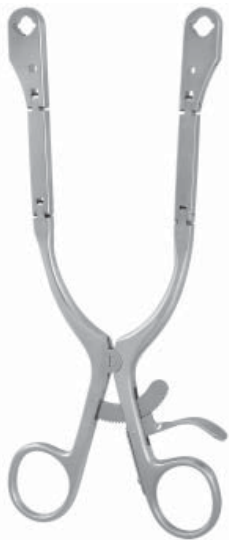
gS 40.7690 Double Hinged Retractor 8 3/4"