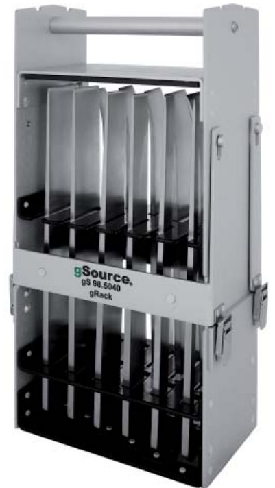
gS 98.6040 gRack, Lambotte Osteotome holds 12 9" osteotomes 12"