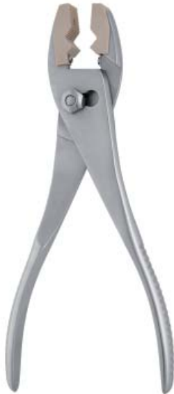
gS 81.3630 gPliers, Slip Joint with PEEK inserts 8"