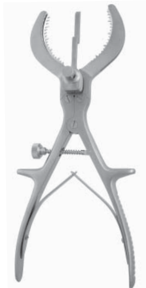
gS 46.2315 Patella Osteotomy Forceps 11"