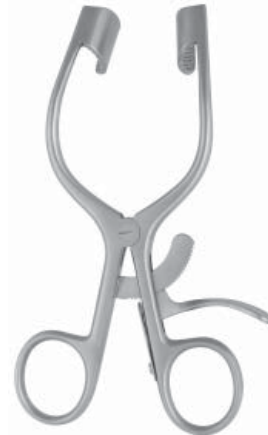
gS 40.3160 gRetractor, Rahner 6"