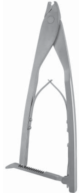
gS 82.7982 Rod Holder narrow nose 11"