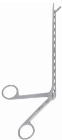
gS 67.0222 - 67.0244 Clean Wave Caspar IVD Rongeurs 7 1/4"