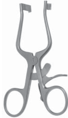
gS 38.5500 gRetractor, Trigger Finger 4 1/4"