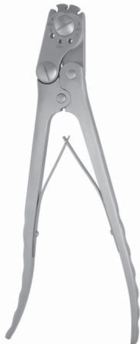
gS 83.9135 Pin Shears for 2.5mm, 3.0mm, 3.5mm pins, 11 1/2"