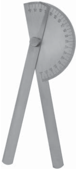
gS 74.2180 gGoniometer 180° standard 8"