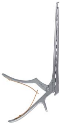
gS 69.3081 - 69.3085 Clean Wave Kerrison Punches 8", thin foot plate