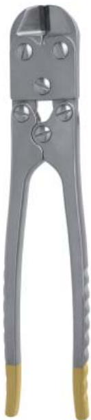
gS 83.8880 gPin Cutter angled, side 9"