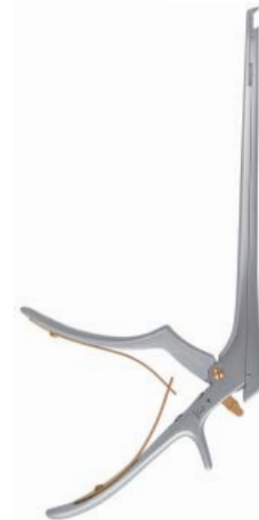
gS 69.4081 - 69.4086 Easy2Clean Kerrison Punches 8", thin foot plate