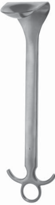
gS 36.9738 - 36.9740 Browne-Deltoid Retractors 11"