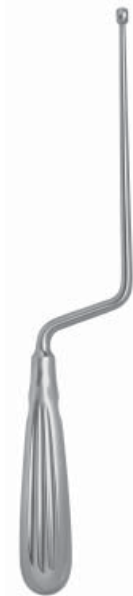
gS 51.5094 - 51.5096 Kraemer Bayonet Ring Curettes 10"