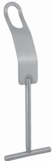
gS 36.0030 - 36.0035 Fukuda-Kujat Style Humeral Head Retractors 9"