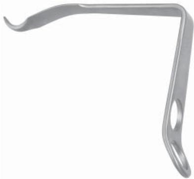
gS 37.3010 Ranawat Knee Retractor 9 1/2", 90°