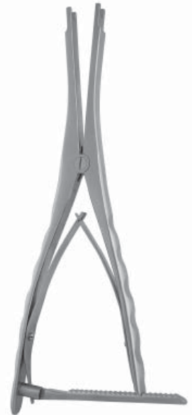
gS 40.3555 gDistractor, MIS 10"