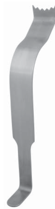
gS 36.9793 Posterior Glenoid Neck Retractor 10"