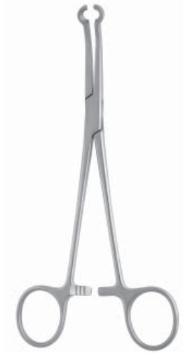
gS 86.6155 Screw Holding Forceps 7 1/2"