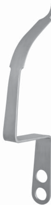
gS 36.9622 C-Retractor rounded blunt end 12 1/2", angled