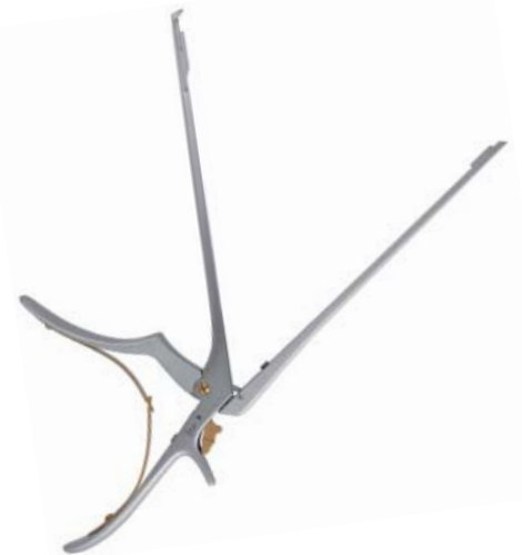
Easy2Clean shown in open position for complete cleaning between slider and main body of shaft.