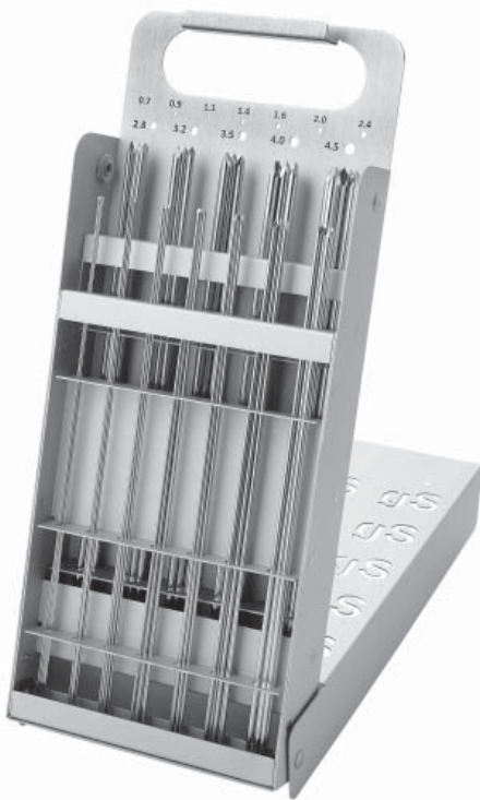
gS 98.5409 gRack, K-Wire and Pin holds 9" K-Wires and Pins 12 1/2"