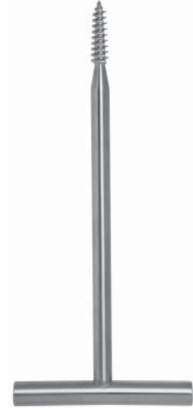
gS 87.4080 gExtractor femoral head, t-handle 8 1/2"