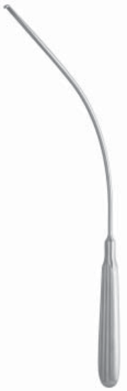
gS 36.6420 gRetractor, Sandhu Nerve Root 9 1/2", malleable