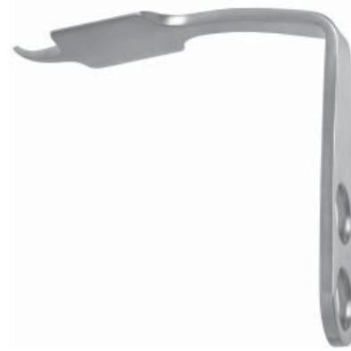
gS 36.9390 gRetractor, Bent Hohmann 6 3/4", 90°