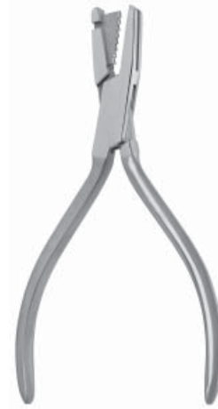
gS 82.1050 Seven Step Wire Bender 5 1/2"