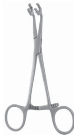
gS 46.3010 - 46.3020 Ikuta Bone Clamps 6 1/4"