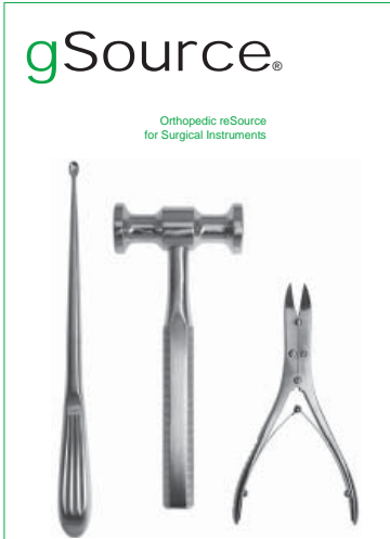
Cover of the gSource catalog

To see our complete product offering, request our catalog or view it on-line at www.gSource.com .