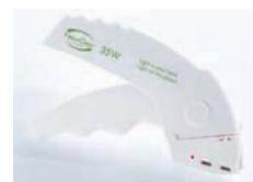
NewGen Surgical Skin Stapler

"Using NewGen Surgical products is not a one-time benefit, but a measurable avoidance of plastic waste — for each product — year after year," said Rob Chase, Founder and President of NewGen Surgical. "Really, it's a way forward out of our dependence on single-use disposable plastic products. While the medical device market is a complicated space, after a period of development to ensure efficacy, performance and regulatory compliance, our products can help customers looking for healthier product solutions. Just one healthcare system could avoid contributing several tons of plastic waste generated from their OR by switching to the same product made from sustainable material. That's one system, one product."