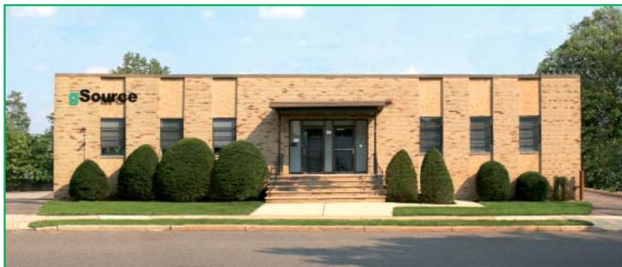
gSource, LLC Emerson, NJ USA Founded 1999