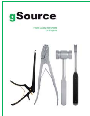
Cover of gSource catalog

Contact us to obtain copies. Please inquire if you do not find an instrument you are looking for in the catalog, as we may be able to custom make it for you.