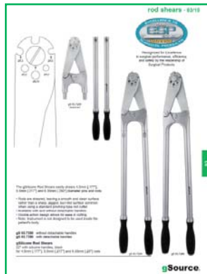
Sample page of gSource catalog