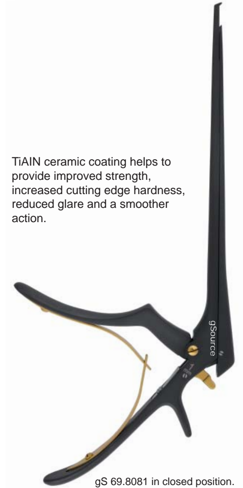
gS 69.8081 in closed position.

Easy2Clean Kerrison Punch 8" forward stainless steel, satin finish thin foot plate Ferris-Smith-Kerrison handle 5"