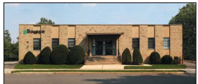
gSource, LLC Founded 1999

ISO 13485: 2003 Certified FS 589741 FDA Registered